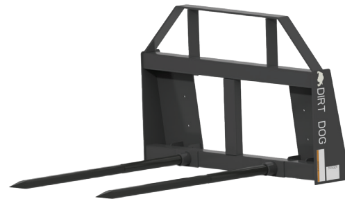
Bale Spear Double