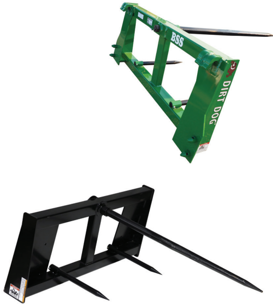
Bale Spear Single