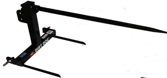
3 Point Bale Spear 1