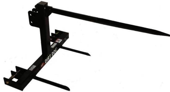
3 Point Bale Spear 2